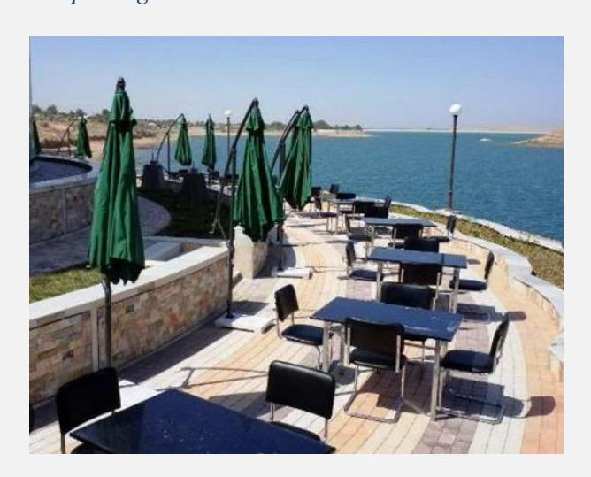
Uchkizil Reservoir, near Termez

Dear guests and participants of the conference, welcome to our ancient city of Termez!