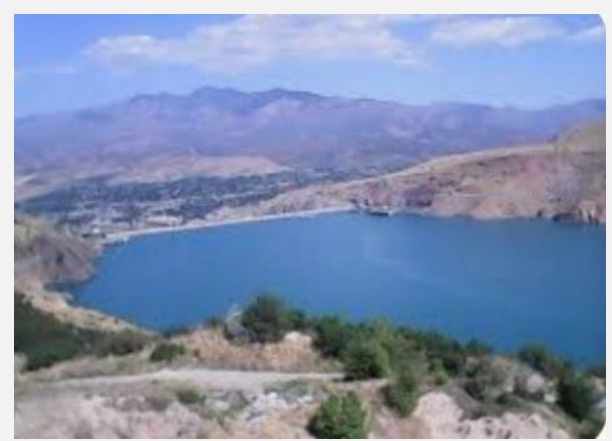
Tupalang Reservoir in the Hissar Mountains